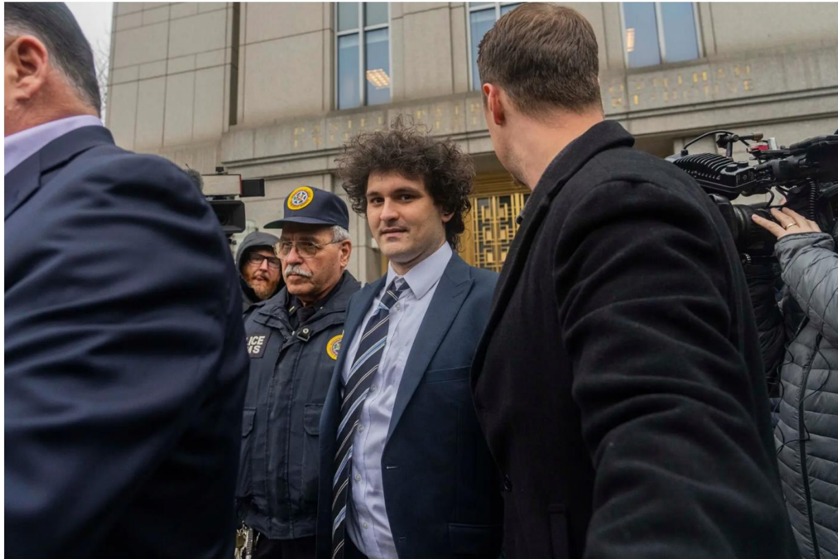
The FTX founder Sam Bankman-Fried, shown in February, was convicted on Thursday after a federal jury in Manhattan deliberated for more than four hours.