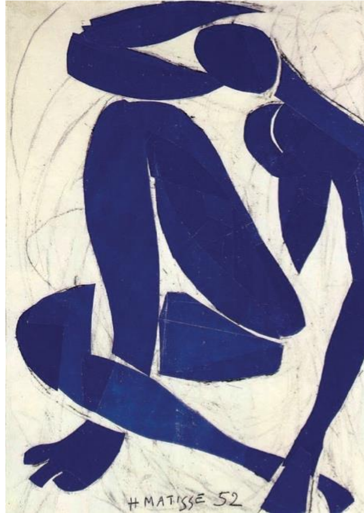
Henri Matisse “Naked Blue IV”